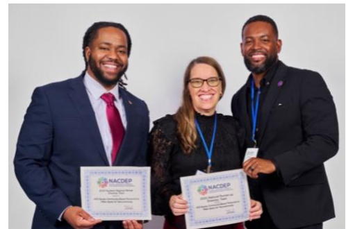
Diversity Team Winners: Virginia Cooperative Extension Team representatives (left and center)